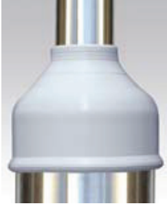
Pipe'n'pipe fitting allows hygienic protection for lagged pipes and reducers.