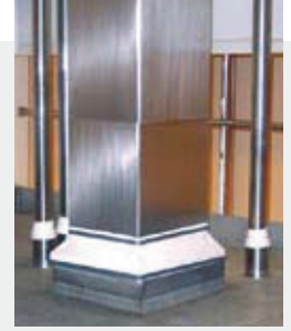
Suitable for square pipes and ducts.