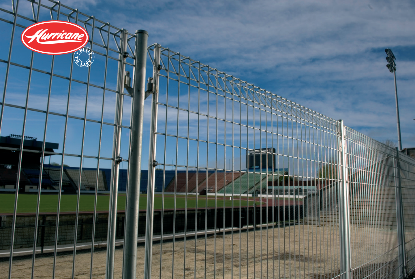
Hurricane fence panels are an attractive slimline profile offering a strong and safe fencing system.