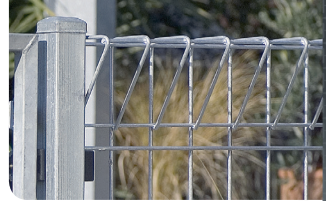
Standard fold top detail (top and bottom).